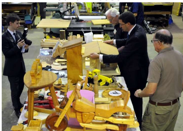
Julian Leeser, 2 nd from right, inspecting some of the toys being made for the Christmas Charity distribution.

Julian Leeser visited our Shed on Tuesday 2 nd May. He inspected the operations of our Shed, including our new Centralised Dust Collection System and the toys we have been making for charity.