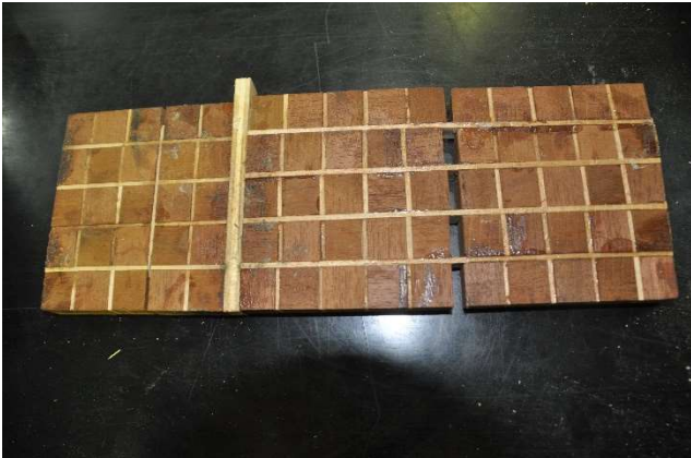
Start of the sides.