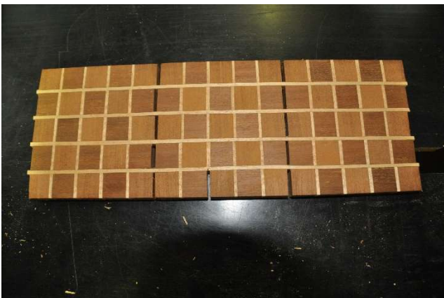
Sides ready to be cut to size