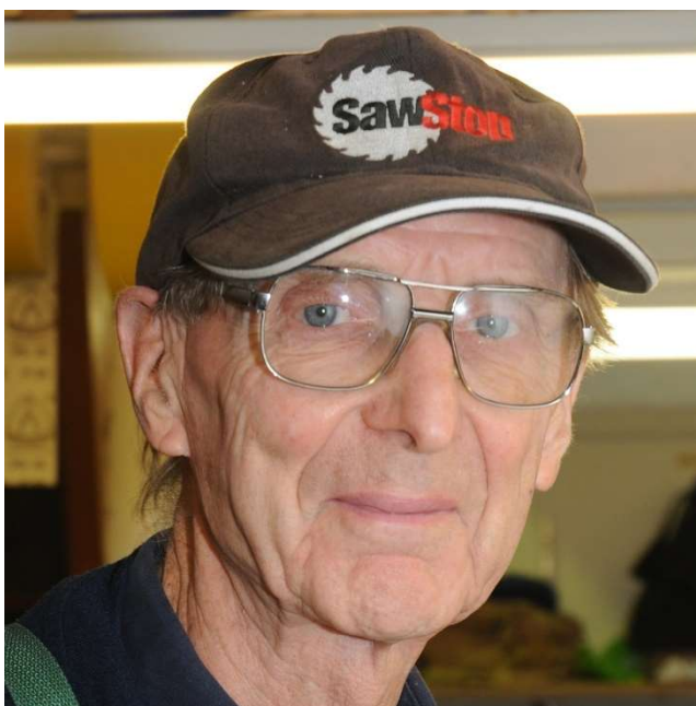
Jim Spence