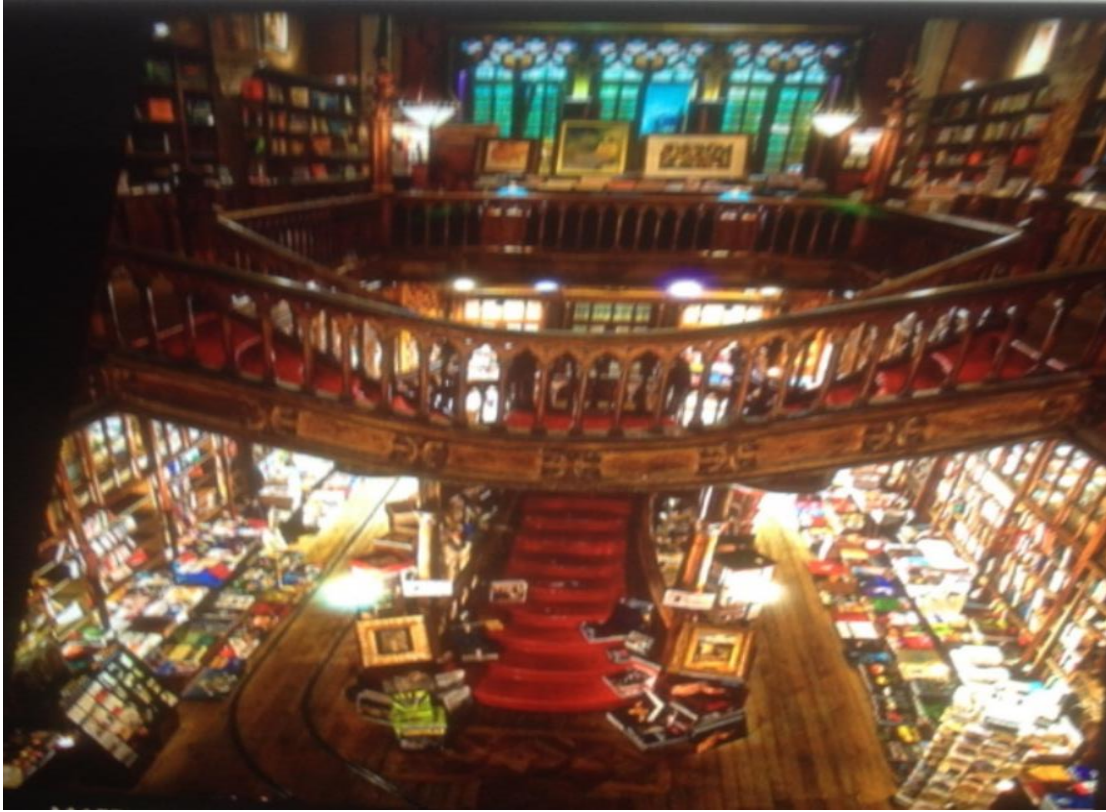
ABOVE: INSIDE THE FAMOUS LIBRARY